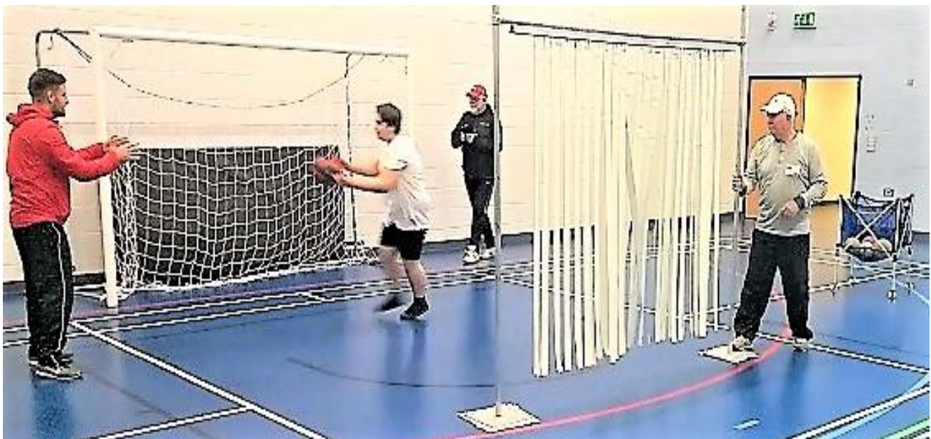
Total Reaction Screen at Ellesmere College, UK.

Australian company, Reaction Advantage Pty Ltd, joined forces with SAQ several years ago to develop a new concept in movement and physical activity training with a training innovation called the Total Reaction Screen (TRS). This technology was included as part of a major UK Public Health funded research project carried out by SAQ which involved over 2,000 primary school children from 14 different schools.